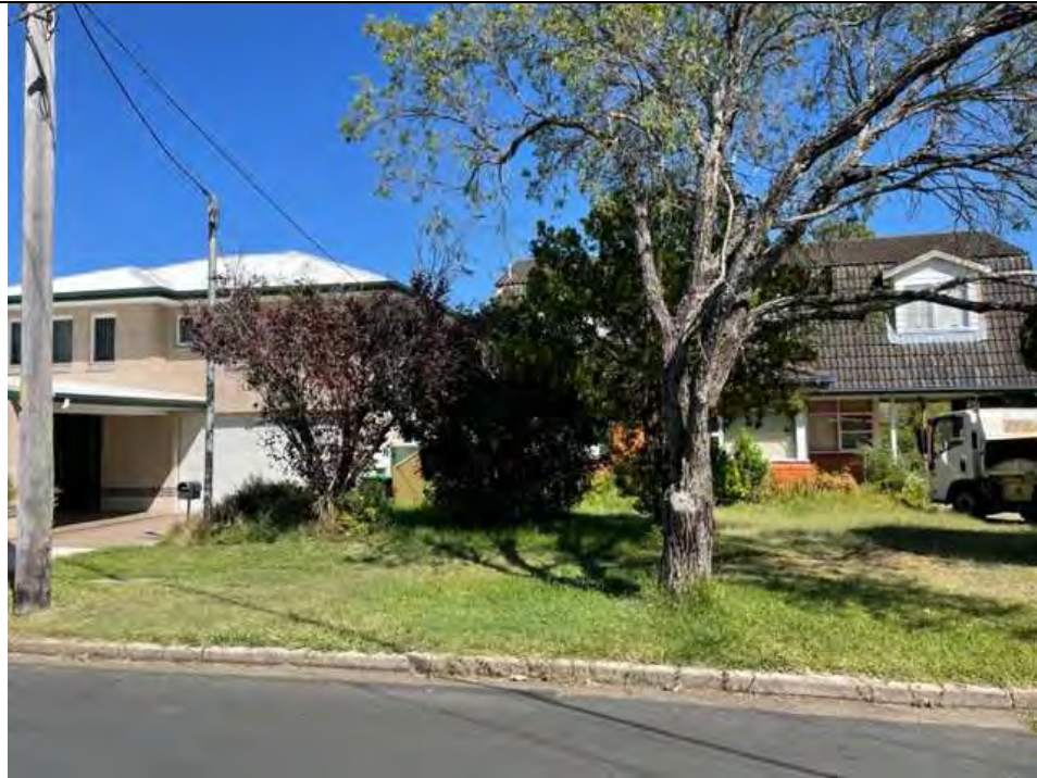
Fig 1: shrubs (Lemnos Ave)