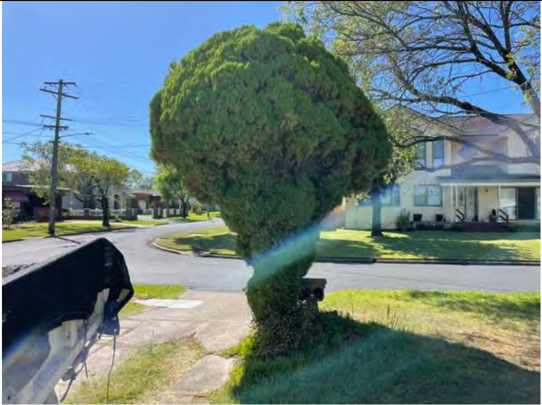
Fig 2: Conifer (Lemnos Ave)