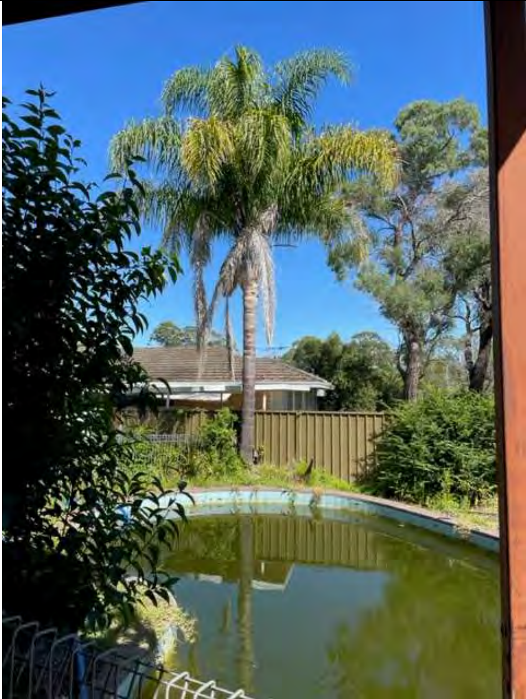
Fig 4: Palm tree to be removed.

All vegetation inside property are non-native and in poor condition to be removed and to be replaced as shown on the landscaping plan.