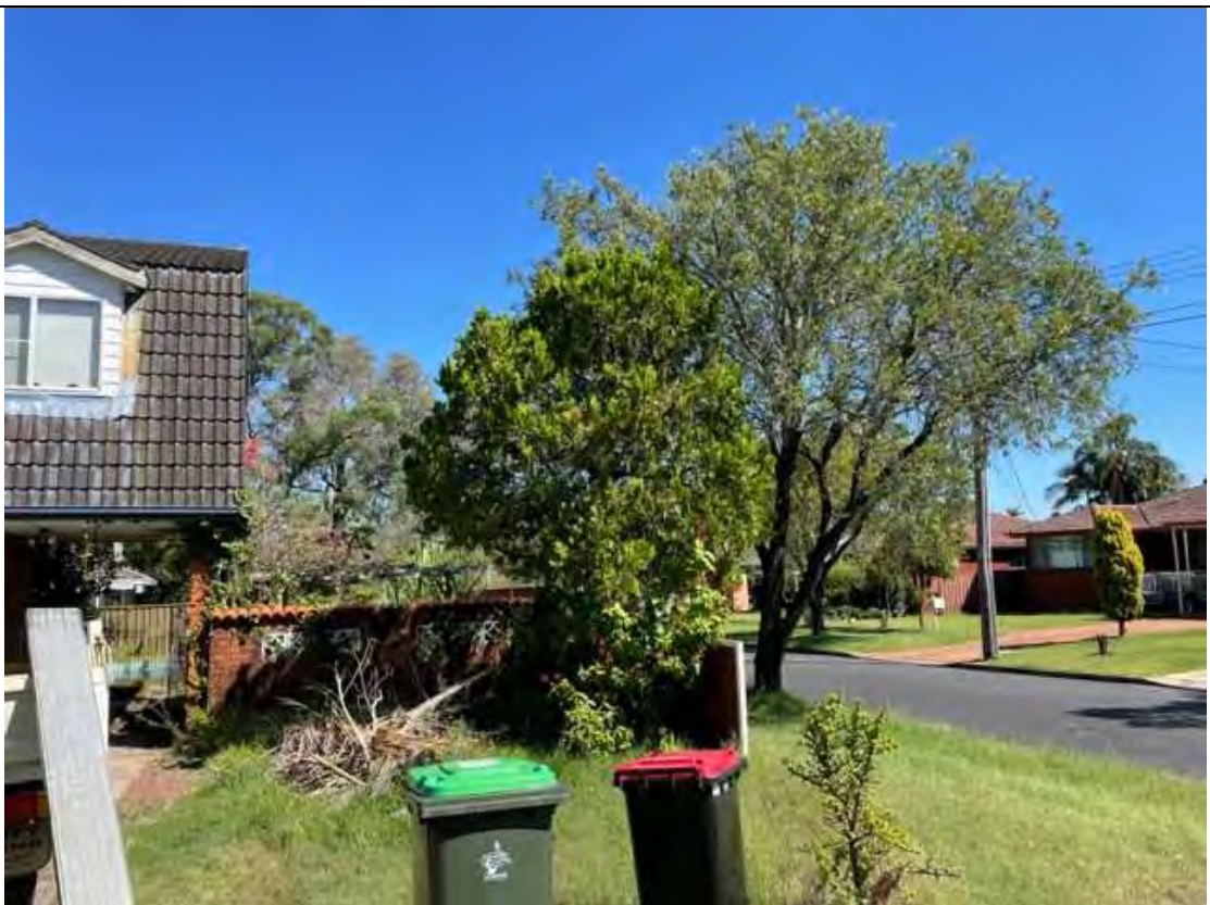
Fig 3: Shub inside property. (Street tree to remain)